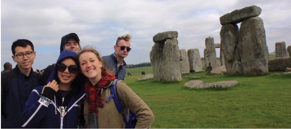
Stonehenge, Salisbury, UK