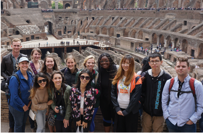
The Colosseum, Rome, Italy