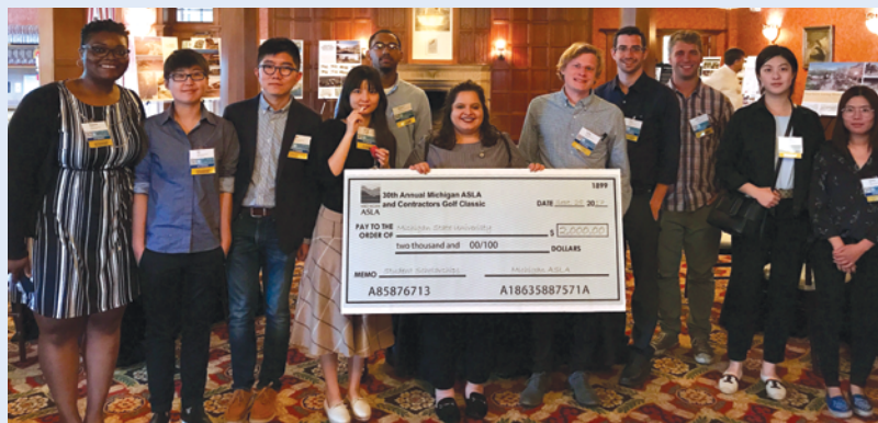
Students accepting scholarship check from MiASLA