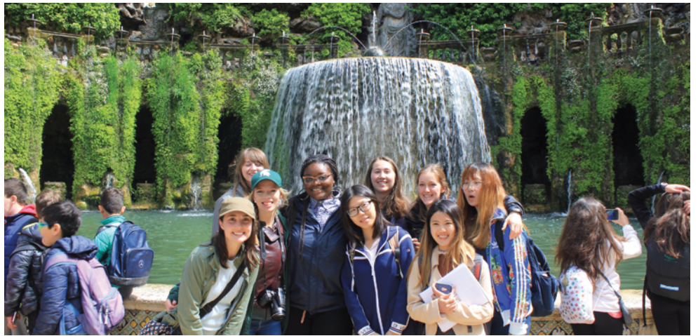
Villa d'Este, Tivoli, Italy

responsible for planning the walks between locations, as well as determining sites for sketches. As a class, we had day trips where we ventured outside of the city to places including Salisbury Cathedral, Stonehenge, Blenheim Palace, Oxford University, Stourhead, and a weekend in Edinburgh, Scotland. Studying abroad in the United Kingdom showed our class that history and modernism can be cohesive within a design, and demonstrated how important concept and purpose are to all design elements.