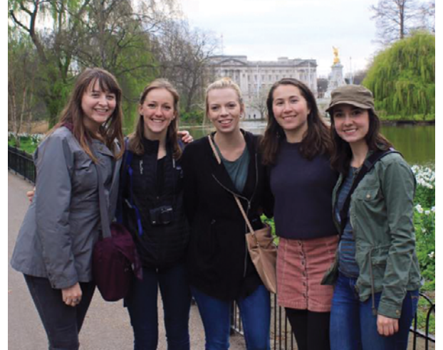
St. James Park, England

responsible for planning the walks between locations, as well as determining sites for sketches. As a class, we had day trips where we ventured outside of the city to places including Salisbury Cathedral, Stonehenge, Blenheim Palace, Oxford University, Stourhead, and a weekend in Edinburgh, Scotland. Studying abroad in the United Kingdom showed our class that history and modernism can be cohesive within a design, and demonstrated how important concept and purpose are to all design elements.