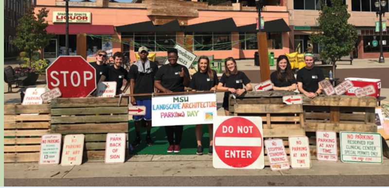
Student parking day

It is with great pleasure that I accept this opportunity to join the Landscape Architecture Program in the SPDC at MSU as associate professor and program leader. I am looking forward to bringing a positive contribution to the program and the school.