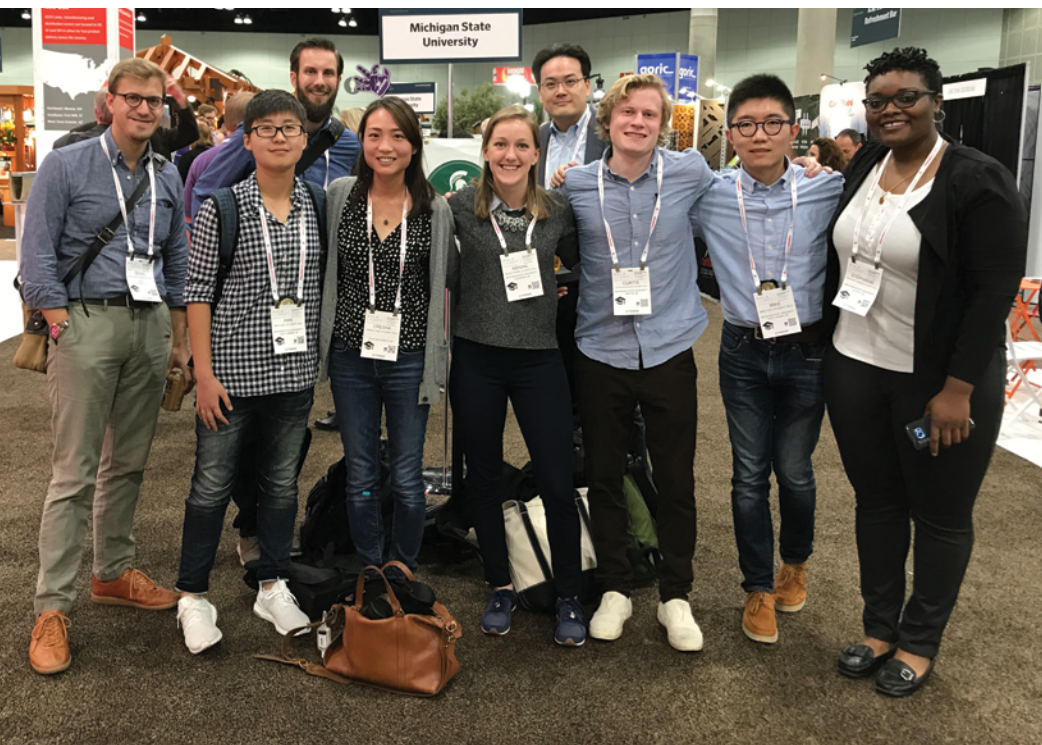
Participants at the ASLA meeting and Expo