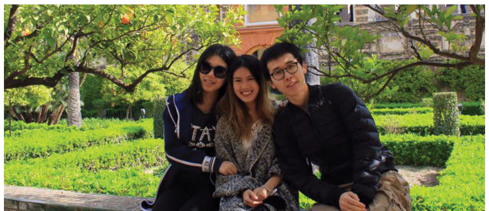
Real Alcazar, Seville, Spain