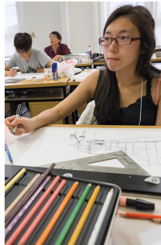
Students participate in graphic workshop.