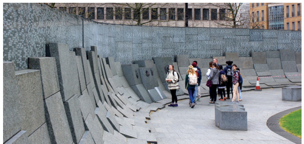
Australian War Memorial, London