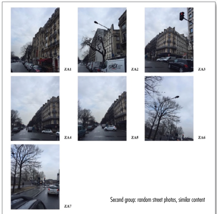
Second group: random street photos, similar content

to a visual "lost space" in the design of our urban environment, making it unsuitable for "real-world" users and instead only pleasing to people who look at photographs. If the profession is highly focused on the visual, it will be difficult to design for our other senses. Relating to the design practices discussed in the beginning, I think hand drawing is still essential in this technological world as a way to study and represent reality. This is because it is people that we are designing for, not just our eyes.