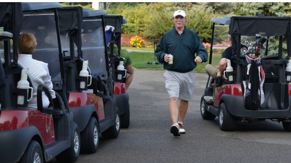
Golfers ready to begin

A heartfelt thank you to the MSU LAClub student volunteers, Hawk Hollow Golf Event Staff, and this year's event sponsors.