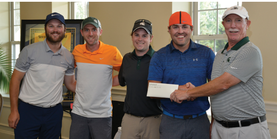
The winning foursome