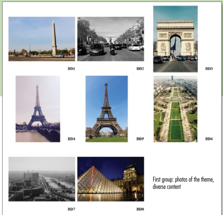
First group: photos of the theme, diverse content